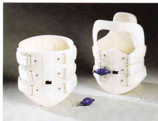
Model = 1515-4 ILSO on left and Model =1530-4 IITLSO shown at right.

For assistance with measurements, contact your PMT representative. PMT is willing to customize any ILSO/ITLSO to fit your needs.