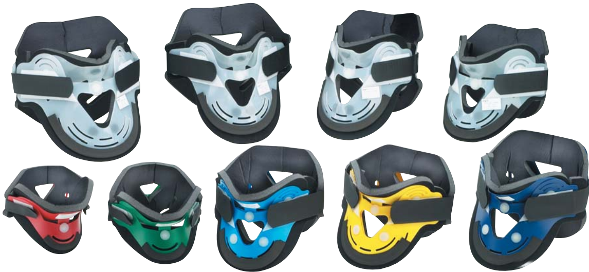
Cervmax™ cervical orthosis collars in adult (top) and youth (bottom) sizes.

PMT's cervical orthosis collar was engineered with your patients' comfort and stabilization in mind.