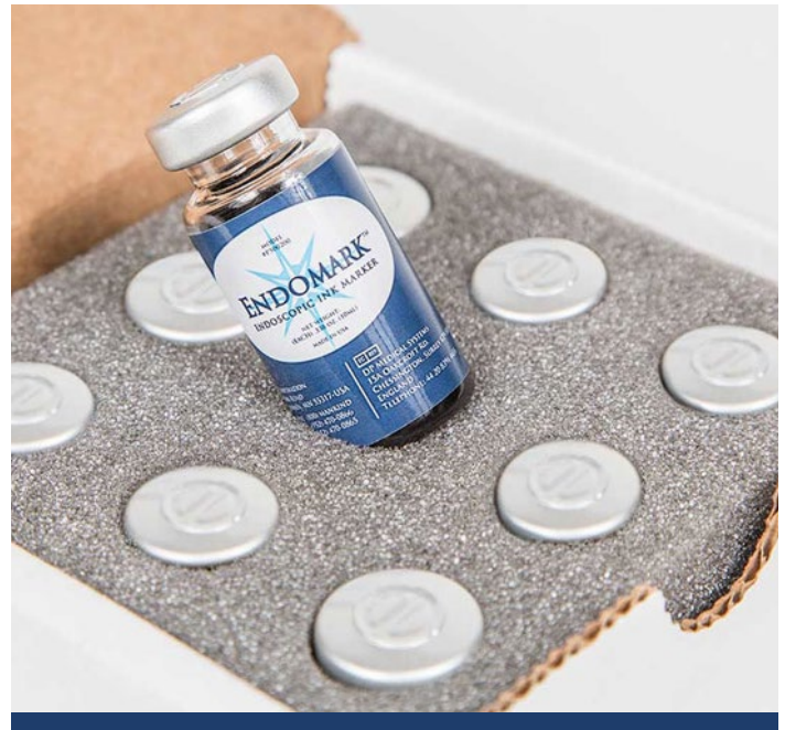
P500 - Pack of 9, 10ml vials